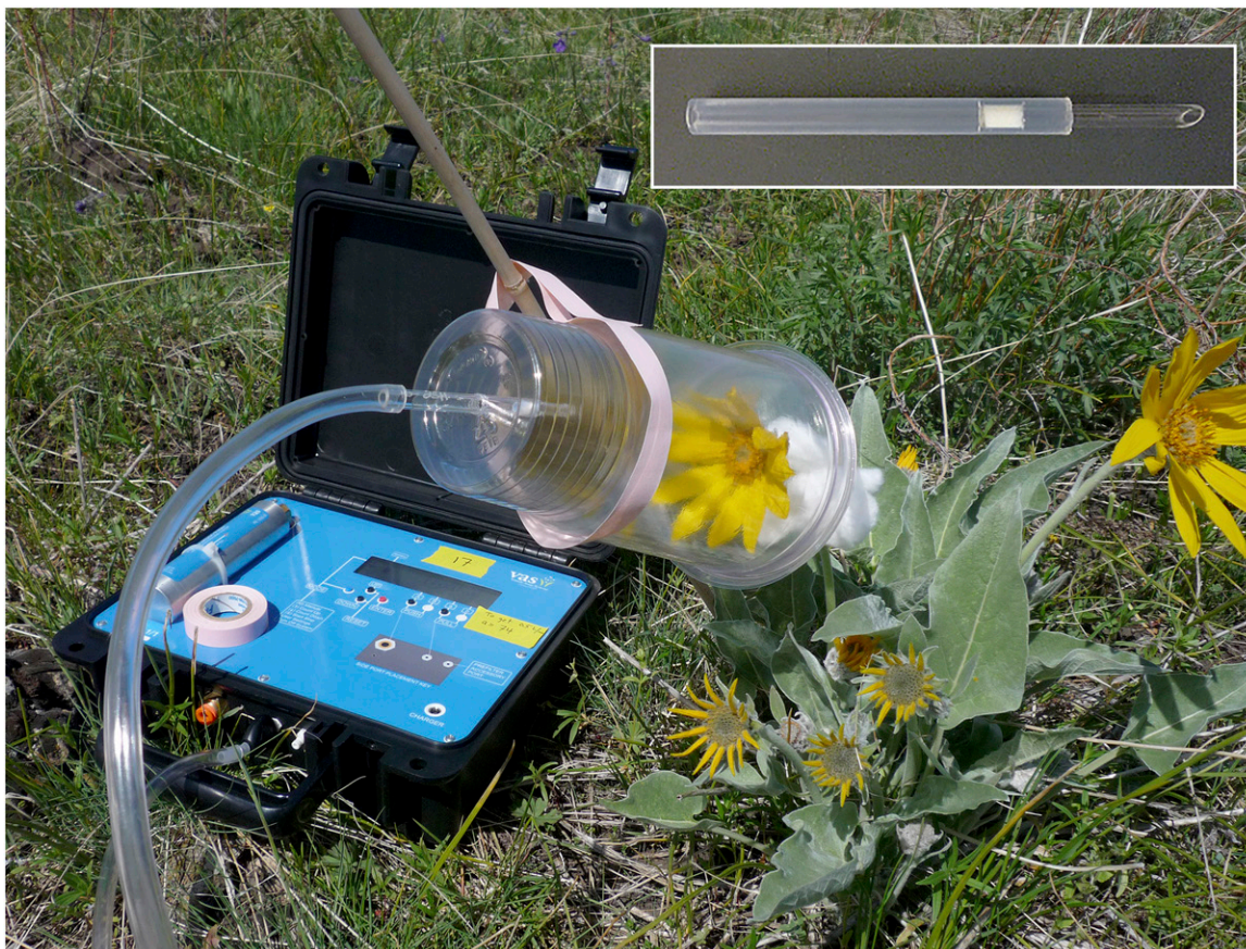
Fig. 2. Collecting VOCs from flowers of arrowleaf balsamroot ( Balsamorhiza sagittata (Pursh) Nutt.) in the field. This setup is being used by the authors to study the effects of environmental change on floral scent and pollinator attraction. The inset shows a volatile collection trap containing a bed of the adsorbent HayeSep Q. Details of this setup are provided in Appendix 1.