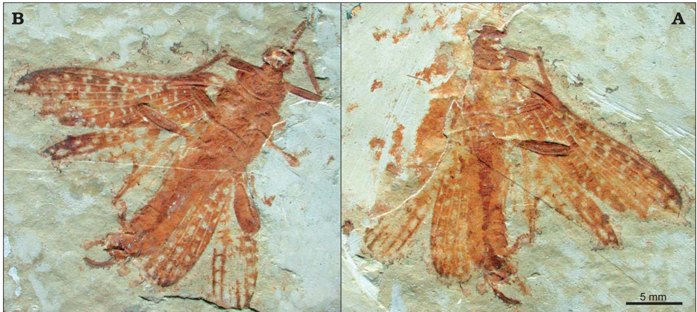
Fig. 1. Susumaniid stick insect Renphasma sinica gen. et sp. nov., holotype A31857, Beipiao City, China, Lower Cretaceous, Yixian Formation. Photographs of print (A) and counterprint (B).

straight, reaching posterior wing margin, a weak but poorly preserved anterior branch of CuP reaching MP+CuA very near to its base; two simple and straight anal veins, anal area 1.3 mm wide.