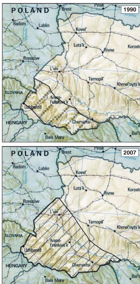
Figure 2. Distribution of the Ural Owl in western Ukraine, as of 1990 and 2007.

In Ukraine, Ural Owls occurred only in the Carpathians area until the last decade. The subspecies S. u. macroura has increased its range southwards and westwards in Slovakia and Hungary (Mebs & Scherzinger 2000, Danko et al. 2002, Adamec et al. 2003, Kristin et al. 2007). The placement of nest boxes has influenced the process of range expansion in eastern Slovakia (Danko et al. 2002). Reintroduction programs at German and Czech sites have been able to re-establish apparently stable populations in the Moravian-Silesian Beskids (Schäffer 1993, Scherzinger 1996, Bufka & Kloubec 1999, Vermouzek et al. 2004).