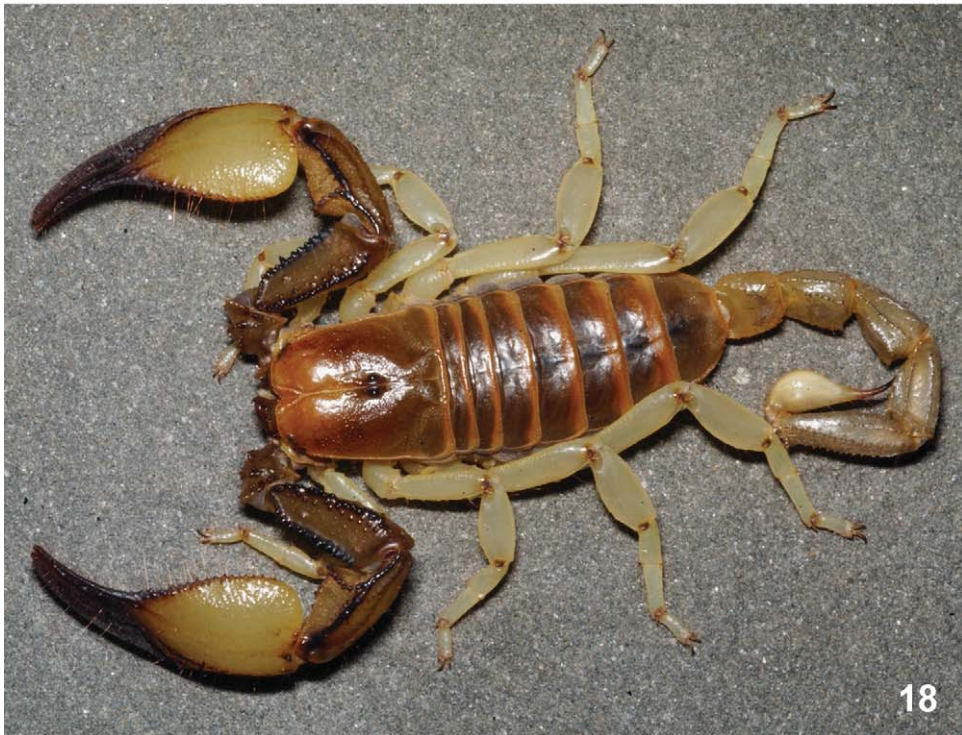
Figs 17, 18. Adult males, habitus in life: (17) Hadogenes tityrus (Simon, 1888); (18) Opisthophthalmus carinatus (Peters, 1861).