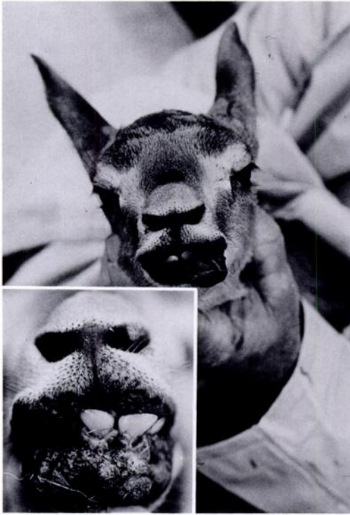
FIGURE 1. A gazelle kid infected with contagious ecthyma. Note swelling of the lips associated with dark encrustations. Inset: close-up view of the cauliflower proliferative skin outgrowth on the lips.