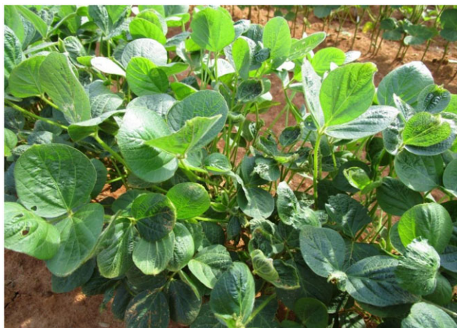
Figure 1. Synthetic auxin symptomology associated with a dicamba application alone at 5.6 g ae ha -1 28 d following a V3 application to soybean in Fayetteville, AR, in 2018.