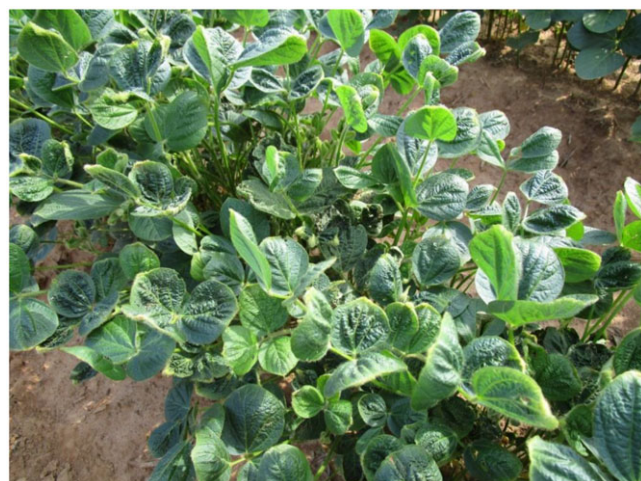
Figure 2. Synthetic auxin symptomology associated with a contamination rate of 5.6 g ae ha -1 dicamba in combination with 656 and 560 g ai ha -1 glufosinate and acifluorfen, respectively, 28 d following a V3 application to soybean in Fayetteville, AR, in 2018.

systemic herbicide such as glufosinate and clethodim or glufosinate and dicamba (Burke et al. 2005; Meyer and Norsworthy 2020), a glufosinate-resistant soybean cultivar will not show contact symptomology of either glufosinate or acifluorfen to the extent that a weed will. When dicamba was applied at the lower rates of 0.056 and 0.56 g ae ha -1 , there was less consistency with the enhanced auxin injury phenotype. Glufosinate mixed with dicamba at 0.056 g ae ha -1 resulted in increased auxin injury at both 21 and 28 DAT, and dicamba at 0.56 g ae ha -1 resulted in increased auxin injury at 28 DAT. When acifluorfen alone or the mixture of acifluorfen and glufosinate were combined with dicamba at 5.6 g ae ha -1 , increased auxin injury was observed, however; this trend was not evident at lower contamination rates of dicamba, similar to what was observed with dicamba contamination of glufosinate (Table 5).