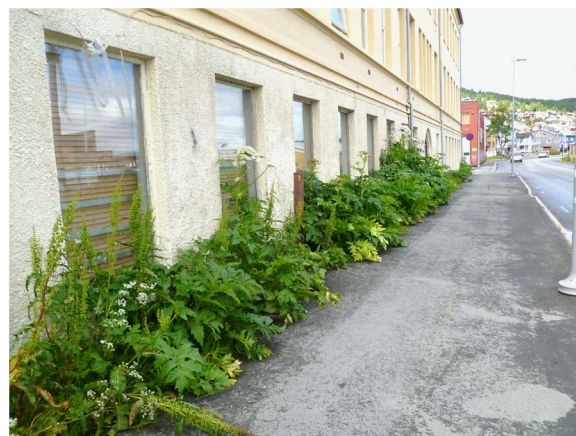
Figure 1. Tromsø palm growing along the wall of a house in Tromsø city, August 2012.

Tromsø palm ( Heracleum persicum ) belongs to the family of Apiaceae (Lid and Lid 2005). It has a 1- to 4-cm-wide hollow stem with purple-red spots; the lower part of the stem is often completely purple-red. The plant can grow to 1- to 4-m high (EPPO/OEPP 2009; Often and Graff 1994). It produces