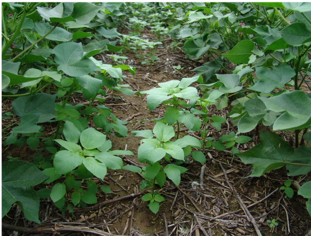
Hophornbeam copperleaf competing with cotton

hophornbeam copperleaf's round cotyledons. The first true leaves of hophornbeam copperleaf are opposite compared with the alternate true leaves of prickly sida. Additionally, the leaf margins of prickly sida are more coarsely serrated than the sharply serrated leaves of hophornbeam copperleaf. Copperleaf also lacks the small stipules (spines) in leaf axils that prickly sida has (Bradley and Rosenbaum 2011). A related species, Virginia copperleaf ( A. virginica L.) can be a troublesome weed species as well.