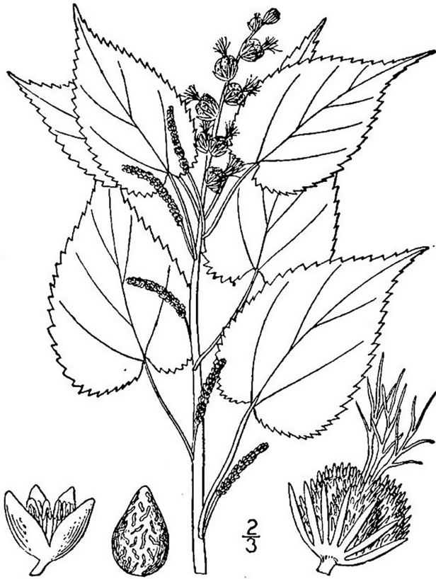
Drawing reproduced from Britton and Brown (1913)