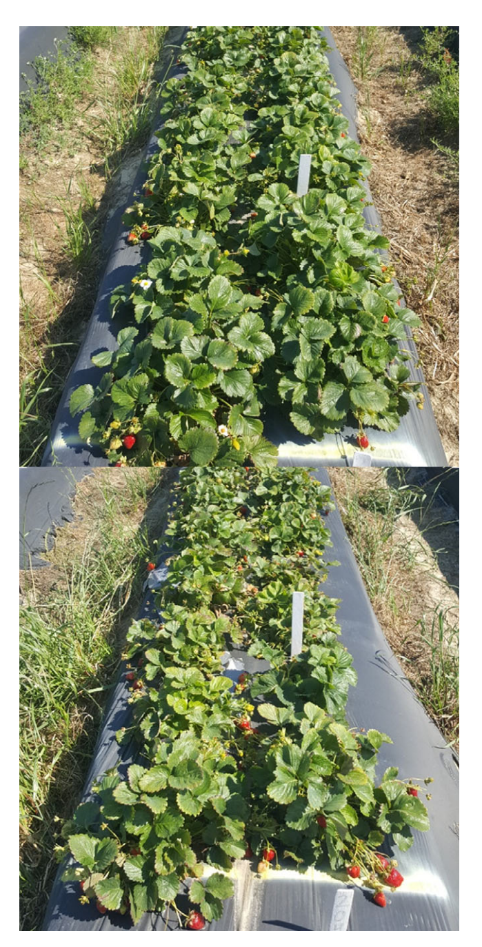
Figure 1. 2,4-D directed to row middle on both sides of polyethylene-mulched strawberry. Nontreated (left) and 2,4-D at 1.06 followed by 1.06 kg ha^{-1} (right) 8 wk after sequential application.

Table 1. Year, planting date, harvest dates, strawberry cultivar, and soil characteristics for 2,4-D herbicide studies conducted in Clayton, NC in 2018 to 2020.