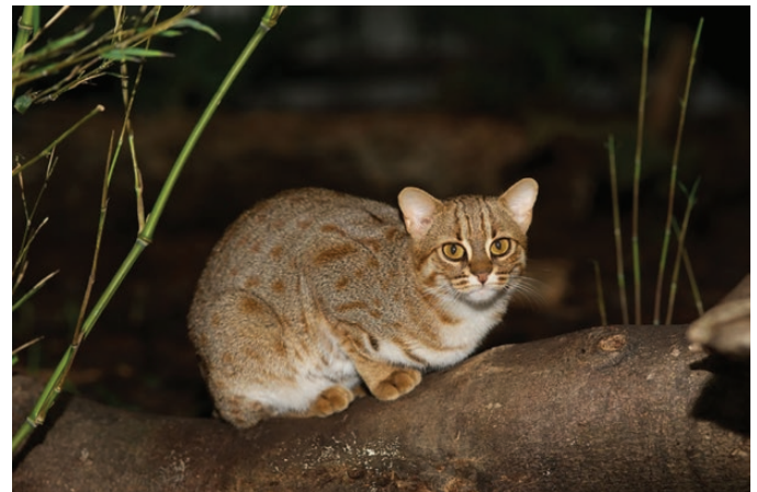
Fig. 1. —An adult female Prionailurus rubiginosus from the Rare Species Conservation Centre, Sandwich, United Kingdom.

CONTEXT AND CONTENT. Order Carnivora, suborder Feliformia, family Felidae, subfamily Felinae. Taxonomy of the leopard cat lineage of Asian small cats has been controversial for many decades, as evidenced by its long history of reclassification at the generic (e.g., Felis , Prionailurus , Viverriceps , Ictailurus , Zibethailurus , Ailurogale , Ailurinus , and Mayailurus ) and species levels (Nowell and Jackson 1996; Kitchener et al.