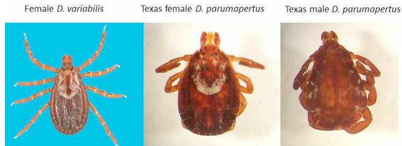
FIGURE 3. Abundant white ornamentation seen on Texas specimens of Dermacentor parumapertus and the similarity with D. variabilis .