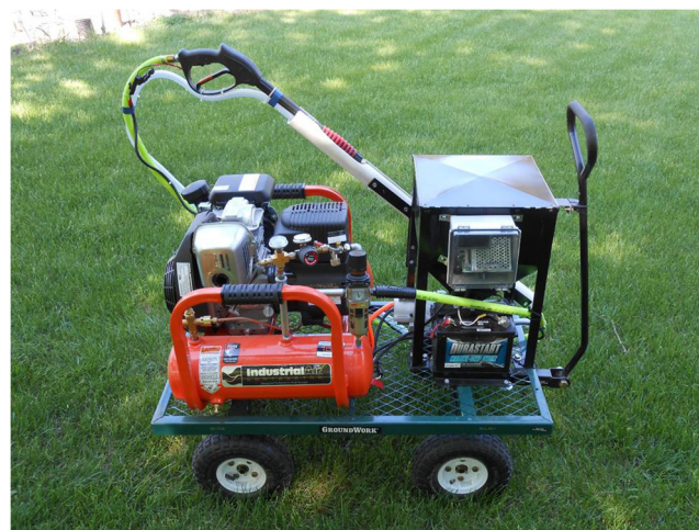
Fig. 1. Portable abrasive grit applicator showing the air compressor, grit tank, battery-powered auger, air and grit hoses, and trigger-operated single-nozzle wand. [Colour online.]

students at South Dakota State University as part of their senior design project. The applicator consisted of a small gasoline-powered air compressor, a grit tank with a motorized auger, a 12-volt battery, a hand-held wand tipped with a single cone-type nozzle, and two sets of flexible tubes that separately connected the auger to the nozzle and the compressor to the nozzle. The wand had a biphasic trigger that opened air flow to the nozzle first and secondly grit flow to the nozzle. The battery powered a small motor that governed auger speed (i.e., the “duty cycle”). With air pressure set at 800 kPa (116 psi) and the duty cycle set at 50 rpm, the delivery rate of corncob grit was 6.6 \pm 0.35 \text{ g s}^{-1} ( N = 3 ), which affected a circular area with a 5 cm diameter at a 50 cm distance. (All settings and rates were determined through a series of preliminary trials.)