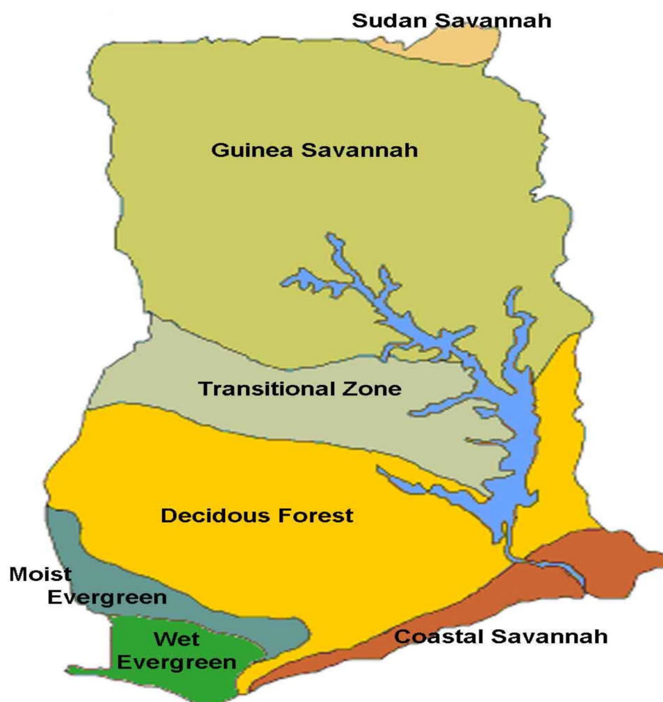
Figure 1. Map of agro-ecological zones in Ghana.

Amponsahkrom and Ayigbe representing Wenchi Municipality of the BR and Deideiman area and Otsirkomfo representing Ga West Municipality of the GAR.