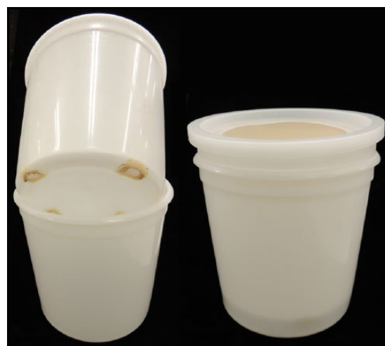
Figure 3. Plastic buckets used for holding fruits for assessment of infestation by tephritid fruit flies. The picture on the left shows the screened bottom holes on the top bucket that permitted the draining of fluids from the fruit to prevent drowning of any infesting tephritid fruit fly larvae. The picture on the right shows the screen on the lid of the top bucket and the buckets as stacked together.

Averages were calculated for weights of fruits collected and numbers of fruit flies recovered per kg fruit and per kg infested fruit. Percentage infestation was calculated based on total number of fruits collected. Oriental fruit fly, Bactrocera dorsalis (Hendel), catch per trap per day was calculated each week for traps in the M casturi and M lalijiwa trees.