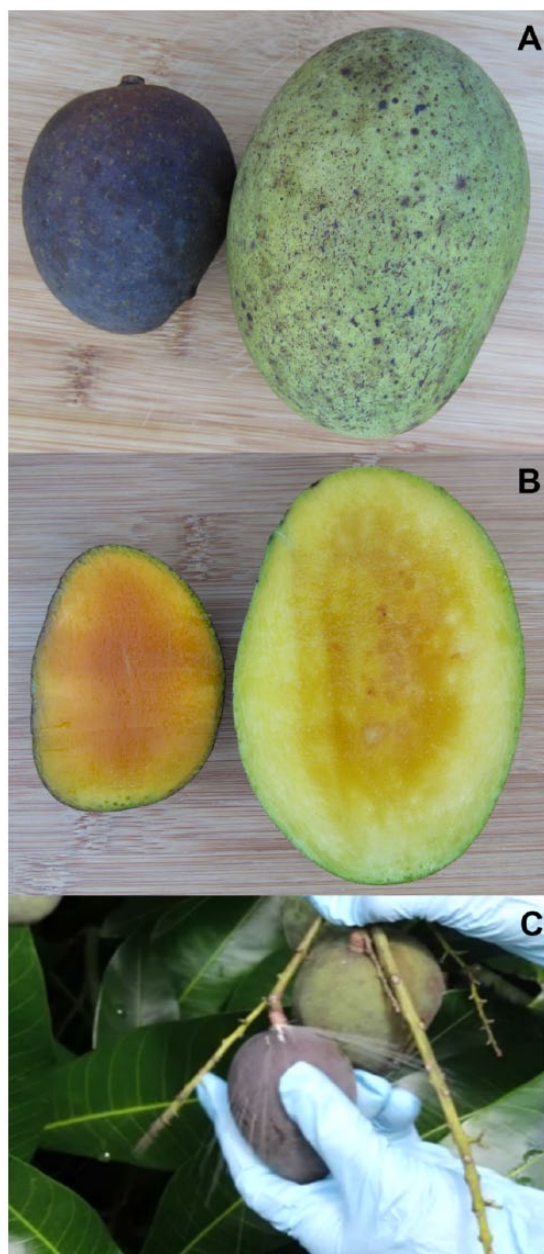
Figure 2. (A) Comparative appearance of mature, undamaged fruits: Mangifera casturi (left) and Mangifera lalijiwa (right). (B) Comparative appearance of pulp of mature fruits: M casturi (left) and M lalijiwa (right). (C) Spray of latex at the point of stem attachment in mature, undamaged M casturi fruit when the fruit is detached from the stem (frame from video [see Video 1]).

were identified to species based on counts of numbers of lobes in the prothoracic spiracles. 8