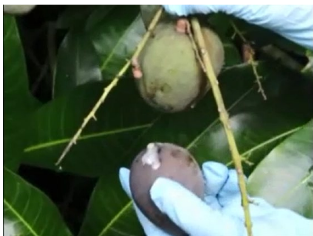
Video 1. Spray of latex at the point of stem attachment in mature, undamaged Mangifera casturi fruit when the fruit was detached from the stem (video). The video is uploaded online as Supplementary material.

Mangifera spp which are documented to be suitable hosts of Bactrocera spp). Given that some of the Mangifera spp are good hosts for B dorsalis , we expect that there are additional, yet undocumented, B dorsalis hosts among others of the 69 Mangifera spp identified by Kostermans and Bompard. 2 It is, however, challenging to document the host status of many of the Mangifera spp. Mangifera spp tend to occur as scattered individuals at very low densities in tropical lowland rainforests. These widely scattered trees can be quite tall such that tree crowns, where fruits are present, can be rather inaccessible, resulting in Mangifera spp being poorly represented even in herbarium collections. An additional problem is that it is common for fruiting to occur only at intervals of 3 to 8 years. 4 As an