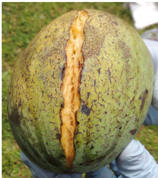
Figure 4. Ripe, cracked, infested M lalijiwa fruit harvested from the tree. A total of 35 Bactrocera dorsalis larvae were present in this 0.499 kg fruit, from which 18 males and 8 females emerged.