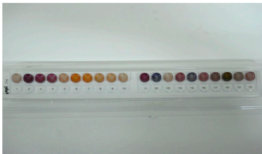
Figure 1. A picture showing the differential staining of the API-ZYM plate with ZYM A and ZYM B after 4 hours of incubation of larval homogenates with substrates dispersed on the porous plate. Each coloured well gives a rank score based on the intensity of colour formed.

approximate amount (in nmol) of the enzyme is given by comparison with a colour scale included in the kit, as compared with the control.