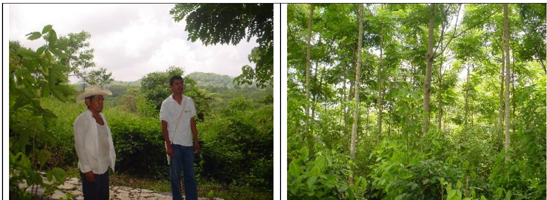
Fig. 2. The picture to the left shows two of the shade-coffee farmers interviewed in this study, while the picture to the right shows an example of a shade-coffee plantation.