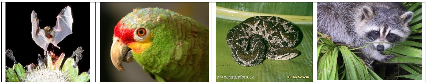
Fig. 3. Examples of four groups of vertebrates (bats, birds, snakes, and non-flying mammals), present in the region of Cuetzalan, and that constituted the focus of the interviews. From left to right, photos correspond to the following species: lesser long-nosed bat ( Leptonycteris curasoae ), red-lored amazon ( Amazona autumnalis ), fer-de-lance snake ( Bothrops asper ), raccoon ( Procyon lotor ).

We chose to interview only male farmers for two reasons: (1) because coffee-growing is a male-dominated activity in this region, and (2) to avoid having another factor (in this case gender) affecting the responses. To gain a detailed understanding of the attitudes, perceptions, and knowledge of farmers we chose to use a method of qualitative research. Consequently, sample size (36) was restricted due to the in-depth nature of the interview applied to each farmer. Each interview was conducted in an oral (both Spanish and Nahua languages were used) and personal way, and lasted 1 to 2 hours. A pilot interview was conducted to make sure that all questions were clearly understood. Interviews consisted of 29 questions, some of which had sub-questions (Appendix 1). Though classification of animals and plants can vary according to culture and language, it became certain during the interviews that all farmers were referring to the same animal groups in their responses as were the interviewers in their questions, namely "birds", "bats," and snakes" (Fig. 3). In the case of non-flying mammals, the photos of individual species were used to ensure the correct identification of species.