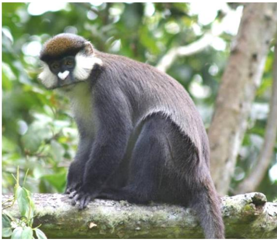
Fig. 1: A red-tailed monkey from Uganda.

A single social group of 19 to 20 members and two solitary males (one adult and one immature) raided the cocoa plantation. Mean monthly raiding subgroup size varied throughout the study (mean = 12.5; range = 7 to 16; Fig. 3) though at times the whole social group entered the cocoa field to raid. Mean monthly raiding subgroup size was related to the total number of pods damaged ( r = 0.538 , P < 0.05 , N = 10 months). However, daily pod damage was negatively correlated to raiding subgroup size ( r = -0.683 , P < 0.05 ), implying greater involvement of solitary males in raiding. Given the secretive nature of crop-raiding, red-tailed monkey group counts should be considered cautiously as they are likely underestimates; however, any bias this would create would only increase the difference between animals in social groups versus solitary animals.