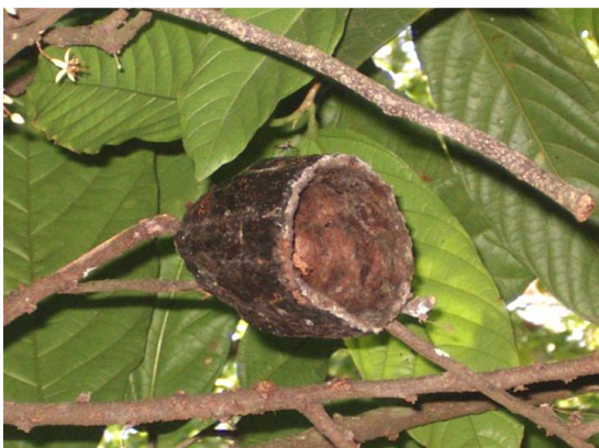
Fig. 2: Evidence of feeding by red-tailed monkeys on the pods on a cocoa tree in the plantation at Kituza Research Station, Uganda

Red-tailed monkeys in the social group ranged most frequently in plots close to the forest edge, while solitaires ranged more extensively. Hence, cocoa pods in plots near the forest edge were more damaged by social groups than those far away ( r = 0.61 , P < 0.05 , N = 12 plots). Furthermore, plots farthest from the road suffered higher damage than the corresponding plots near the road ( paired t-test = 3.675, P=0.001 ). On the other hand, adult solitary males were sighted more frequently in plots distant from the forest edge ( r = -0.828 , P < 0.001 ; N=12 plots), and consequently, the pod damage caused by solitaires increased with distance from the forest edge ( r = 0.745 , P < 0.008 ).