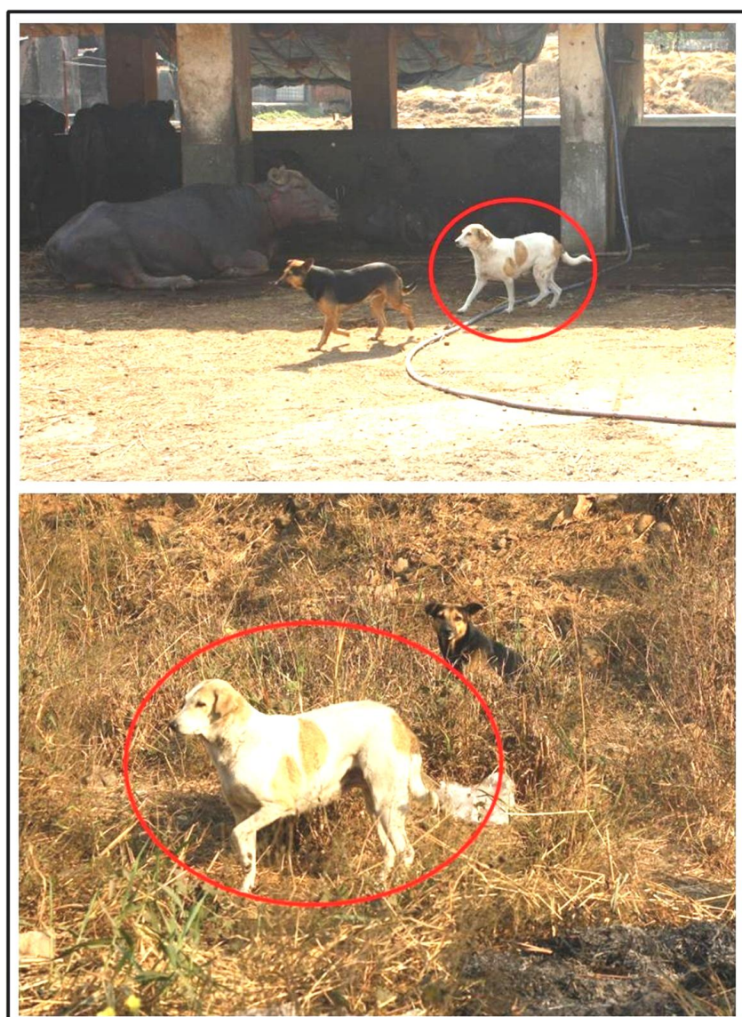
Fig. 2. The image indicates photographs obtained for a distinct naturally marked dog over two secondary sampling intervals in Aarey Milk Colony, India.

[34]. This is similar to Bowden's estimator in the NOREMARK program [24]. As marks were individually identifiable, we used individual heterogeneity models with the data, since we expected individual dogs to have differential sighting probabilities. We used the time-constant models, with or without individual heterogeneity parameters. Since some convergence issues occurred for values of \sigma (individual heterogeneity parameter) for the time-constant model with heterogeneity, we manually supplied initial values covering the probable range of parameters in the three models. We also used other options to overcome convergence issues for values of \sigma , such as the 'Alt.Opt.method' and 'Do not standardize design matrix' in another two models. In all we used seven time-constant models, the first six of which represented the time-constant model with individual heterogeneity, with various options as described above. The last model represented the time-constant model without the individual heterogeneity parameter (where \sigma was fixed to zero). Model comparison was performed in an information-theoretic framework using Akaike's information criteria corrected for small sample size (AICc).