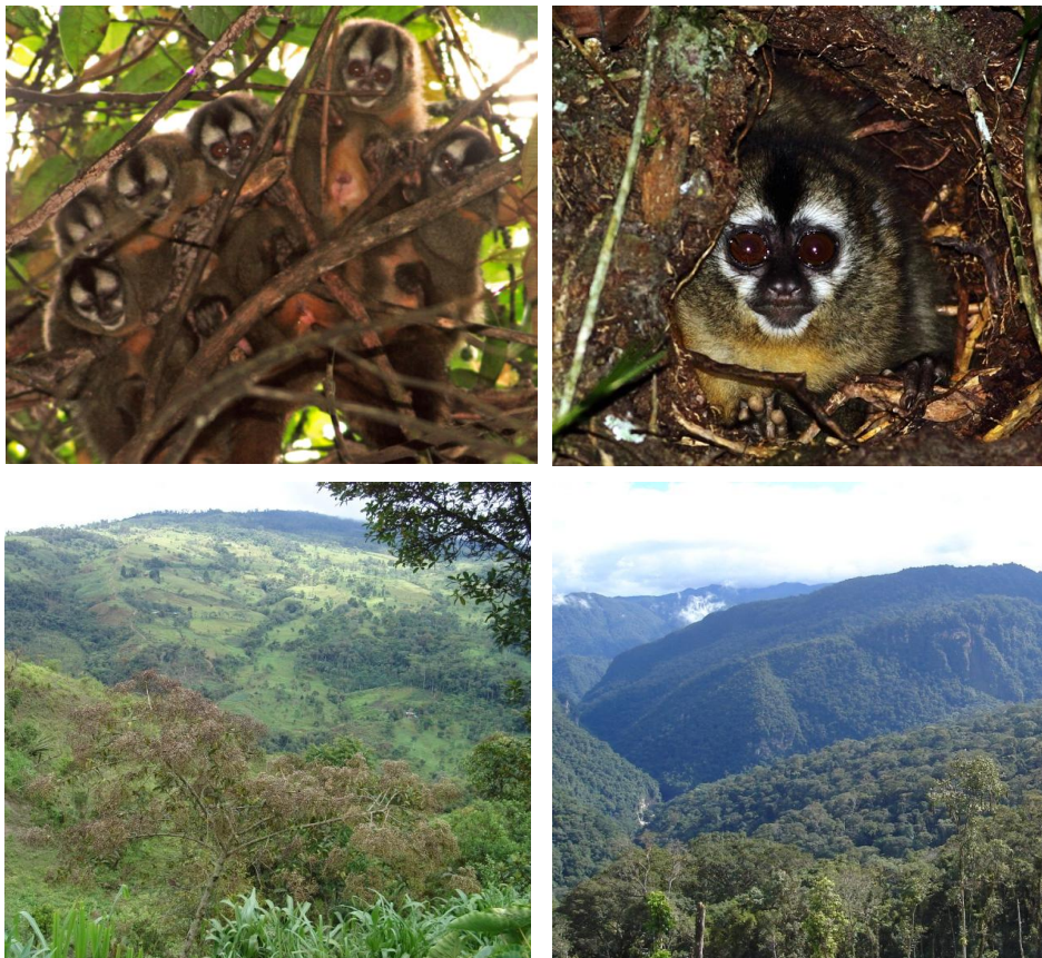
Fig. 3. Clockwise from top left: Study group in vine tangle nest (copyright Sam Shanee/NPC); Adult from study group in nest in hollow tree trunk (Copyright Jean Paul Perret/NPC); Undisturbed forest habitat of A. miconax (Copyright Sam Shanee/NPC); Fragmented forests near La Esperanza study site (Copyright Sam Shanee/NPC).

Our estimate of home range size represents a minimum of the actual space used by this group. For example, on a number of occasions the group was seen to descend to the ground and leave the forest patch to access isolated food sources [23]. On another occasion a follow had to be abandoned after the group travelled past the northern edge of the patch where the ground falls away in a vertical rock face. We could not relocate the group that night and assume they descended the cliff face. How much difference this will make in range size is difficult to determine as resources outside of the home patch are scarce and located nearby. These forays outside of the normal home range are probably necessary for the group to survive in the forest patch. The need to utilize resources outside of the group's home patch could have been necessary because of the unusually long dry season during this study.