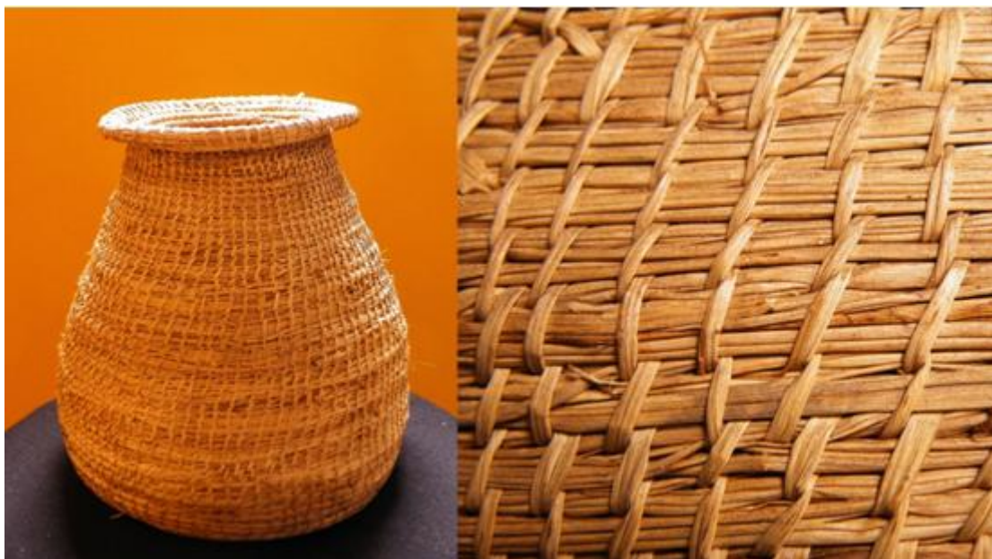
Fig. 2. Traditional basket woven by the Embera at the Pacific coast of Colombia in the mid-1980's, with a detail of its stitches. Baskets similar to this one were woven also by the Wounaan, as recorded by one of the authors. Personal collection of Aida Palacios.

In the traditional Wounaan baskets each stitch passed either through the fiber of the previous stitch (Figs. 1C), or through the foundation of the previous coil (Fig. 2); in the latter, the stitches were widely separated from one another, so that the foundation was visible. Furthermore, the foundation's fiber strand was naked. In the Botswanan technique the foundation is wrapped in fiber, resulting in a solid coil (Fig. 4C); each stitch completely surrounds the current coil and the previous one (Fig. 4B-C), and the stitches are so tight that the foundation is not visible. This technique is not exclusively Botswanan but is also found in such remote areas as Thailand and the Pacific coast of North America [12].