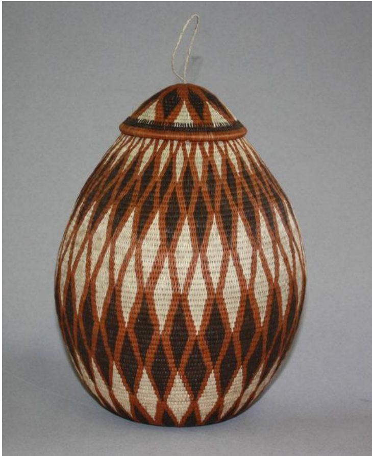
Fig. 3. Basket woven by the Ba Yei and HaMbukushu of Botswana, 2012.

the start of the A. standleyanum basket boom. Within a few years the Wounaan baskets had gained a reputation among Colombian handicrafts, and by the early 1990s they fetched high prices in handicraft shops in Bogotá [16] and had even reached shops in New York (R. Bernal, pers. obs.).