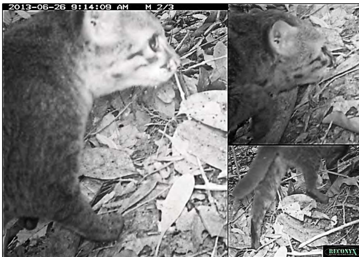
Fig 3. Composite of three camera trap images of one of the flat-headed cats detected in Pasoh Forest Reserve, Peninsular Malaysia, in June 2013, showing details of ear shape and tail.

and Krau Wildlife Reserve [1], all forest blocks of more than 600 km 2 . Pasoh is only a quarter of that size, indicating that this felid species may occur in smaller forest fragments than initially thought.