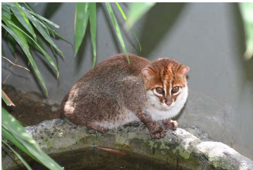
Fig 1. Image of captive flat-headed cat.

A study carried out between 1968 and 1974 [6] recorded that a flat-headed cat had been captured by indigenous people within Pasoh Forest Reserve, in central Peninsular Malaysia. Pasoh's fauna was extensively researched and several other mammalian studies were conducted afterward [7], but there was no further record of this felid species. In recent decades Pasoh has lost many of its large vertebrates, becoming a defaunated ecosystem in which the largest remaining carnivores are the leopard Panthera pardus , sun bear Helarctos malayanus , and dhole Cuon alpinus , all of them probably occurring at very low densities [8]. Increased accessibility from surrounding plantations has presumably contributed to the current strong encroachment and poaching pressure. Here we report the camera trap detection of two flat-headed cats moving together during daytime in Pasoh Forest Reserve in June 2013.