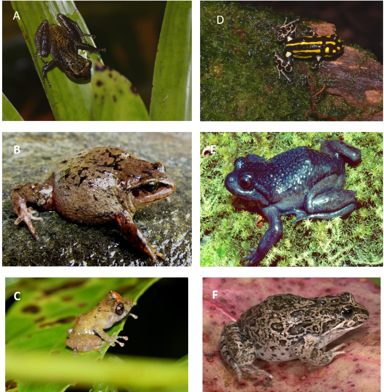
Fig. 3. Species with a change in assessment. A. Pristimantis pardalinus . Photo R. von May; B. Phrynopus peruanus . Photo R. von May; C. Pristimantis cruciocularis . Photo A. Angulo; D. Ranitomeya flavovittata . Photo A. Angulo; E Telmatobius timens . Photo A. Catenazzi; F. Pleurodema marmoratum . Photo A. Catenazzi.

The number of Peruvian amphibians included in each category according to The IUCN Red List was very similar to the number of Peruvian amphibians included in the national list [15] (Fig. 2). A thorough inspection of the national list further revealed that the occurrence of two amphibian species, Hemiphractus bubalus and Psychrophrynella wettsteini in Peru is uncertain given that no collections of voucher specimens (or photographic vouchers) are available from the country.