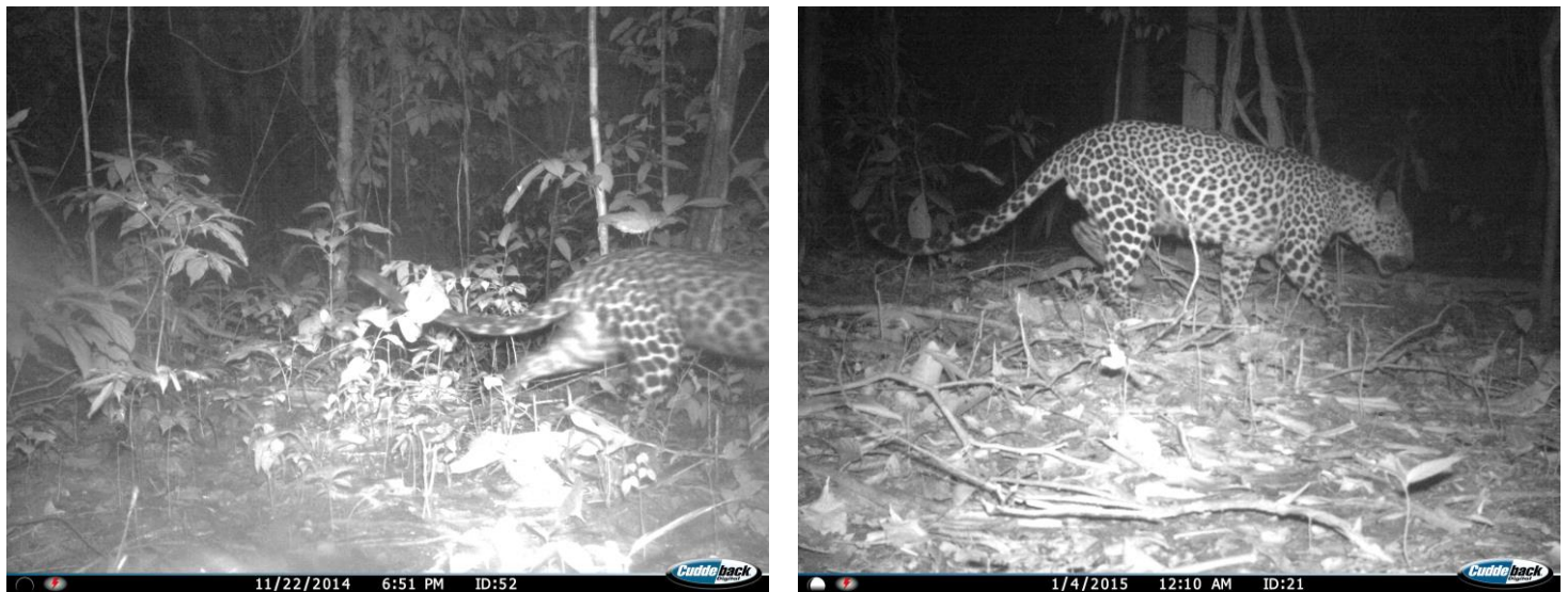
Fig. 3. Trap photos of one possible female (left) and one male (right) spotted leopard.

The spotted leopard is rare in Peninsular Malaysia – so far it has been reported only in two other written works: one in Endau Rompin National Park, in the southern state of Johor [8]; and the other mentioned anecdotally (in an old identification book) as being outnumbered by 'conventionally colored leopards' in Malaya [9]. This is despite the extensive camera trapping efforts in Peninsular Malaysia, all of which (with the exception of the above two studies) have recorded the presence of only the melanistic form [6, 10-15]. A study in 2010 examined the frequency of leopard melanism in 22 locations in Peninsular Malaysia and southern Thailand [5] (Fig. 2). Out of 42,565 trap-nights, 445 photos of melanistic leopards and 29 photos of the spotted morph were collected; all photos of the spotted leopard were taken from study areas north of the Isthmus of Kra, which is the narrow neck of southern Myanmar and Thailand and a well-known zoogeographical boundary [16]. We also added data from five studies since 2010 on figure 1. All these suggest that spotted leopards are at the very least rare in Peninsular Malaysia.