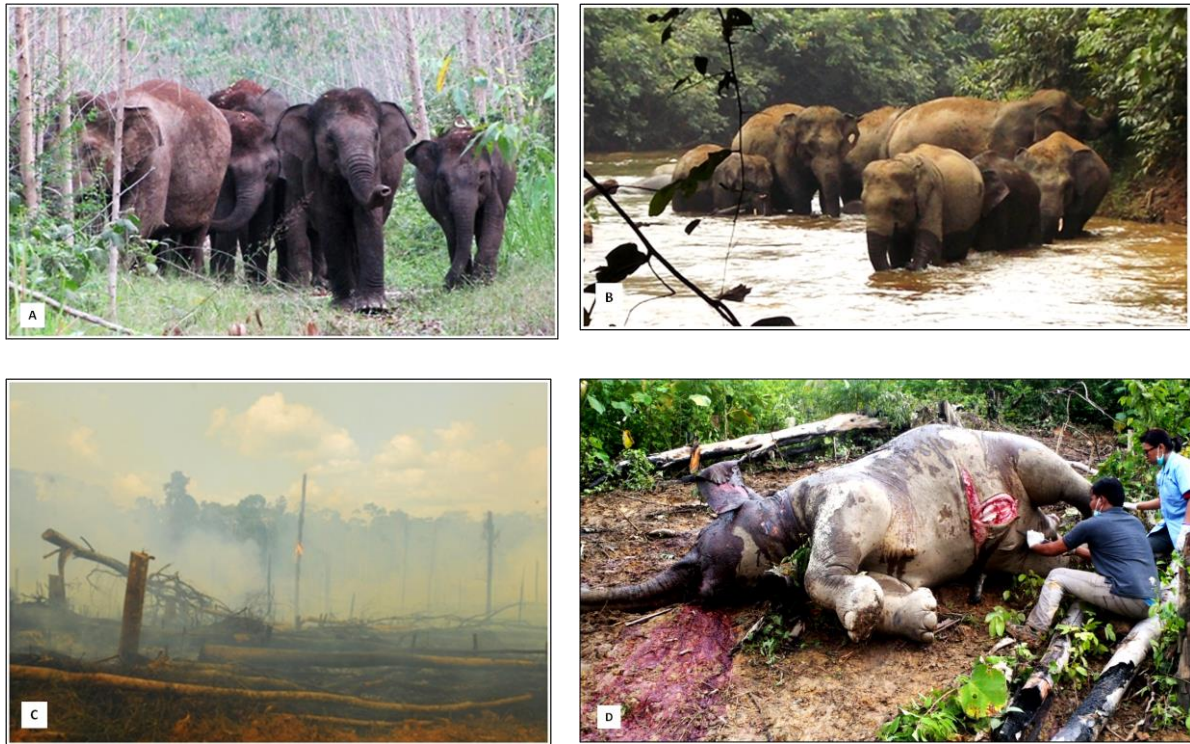
Fig. 3. A group of Sumatran elephants searching for food in a pulpwood concession in survey area RiauJambi (A); part of a larger elephant herd drinking and taking a bath in survey area Sumai (B); forest destruction, one of the main problems for elephant conservation in Bukit Tigapuluh (C); postmortem of a poisoned adult female elephant (D).