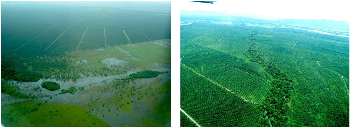
Fig. 2. Aerial view of oil palm expansion in the Llanos region of Colombia, Casanare State (left) and Meta State (right).