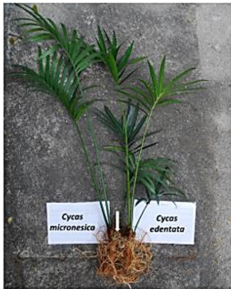
Fig. 3. General appearance of healthy Cycas micronesica and Cycas edentata seedlings that were bare-rooted after being grown with root competition from February to December 2014. White arrow points to coraloid root clusters within which cyanobacterial endosymbionts fix nitrogen.