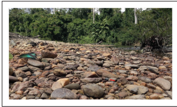
Figure 6. The natural habitat of Heterosphecia tawonoides in Peninsular Malaysia. Arrow indicates the sesiid mud-puddling on rocks.