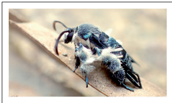
Figure 1. Heterosphecia tawonoides puddling on a dry leaf washed out by the river.

individuals were seen mud-puddling on a sandy/pebble river bank, a behavior recorded only recently for the family Sesiidae (Gorbunov, 2015; Skowron, Munisamy, Hamid, & Wegrzyn, 2015; Skowron Volponi & Volponi, 2017; Szabolcs & Pühringer, 2016).