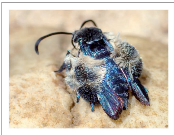
Figure 3. In sunlight, Heterosphecia tawonoides has a strong blue sheen on wings, abdomen, and tarsomeres.

Strong blue sheen on wings (both transparent and scaled areas, Supplementary video TC: 01:44–01:49, Figure 3); Legs and abdomen: Bigger and strongly light-reflecting, metallic blue scales on margins of each tergite form distinct bands in sunlight (Supplementary video TC: 01:00–01:05, 02:50–02:58). Characteristic tufts of hair-like scales present on all tibia but are longest on hind legs, with alternate shiny blue and creamy white coloration (Figure 1). Strongly elongated, creamy white hair-like scales of hind tibia extend interiorly over folded wings and abdomen in natural resting position.