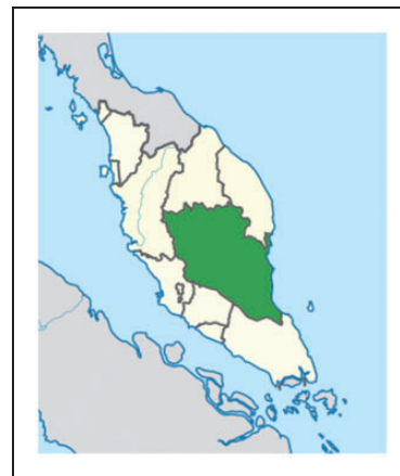
Figure 2. Map of Peninsular Malaysia. Pahang state is marked in green.

Temperature and humidity measurements in the field were made using a TFA Dostmann electronic thermo hygrometer in the shadow each time that H. tawonoides was observed. Photographic and video documentation was made with Olympus TG-3, Sony DSC-RX10, and Sony PXW-FS5 digital cameras. Photographic and video documentation, as well as behavioral observations were made in the natural habitat of H. tawonoides , in three locations (approximately 20 km and 50 km away from each other) in lowland dipterocarp forests of Pahang State, Malaysia (Figure 2). Four individuals were collected in Kuala Tahan, Malaysia, and pinned for morphological analyses. Male genitalia were dissected and prepared as follows: (1) maceration of the abdomen in boiling 10% KOH, (2) dissection in 10% ethanol, (3) dehydration in 30%, 60%, and 100% ethanol, respectively, and (4) mounting in Euparal. Morphological details were studied with a Leica M80 stereomicroscope and photographed using a Leica M205A. Morphology of male genitalia was compared with Figure 7 in the study