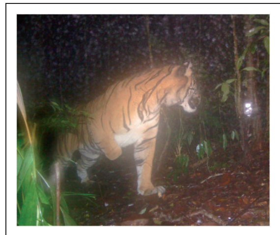
Figure 3. Camera-trap image of a wild, 3-legged Sumatran tiger taken on November 13, 2019 in an area frequented by poachers in the Ulu Masen Ecosystem. Eight days prior, on November 5, 2019, a community ranger patrol team dismantled 28 wire and steel snare traps in a 1 km 2 area of forest surrounding the location of this photograph. Also on November 5, 2019, we observed carcasses of one sun bear and one dhole, both killed by snare entrapment. Subsequently, a live 3-legged sun bear was photographed at the same location in January 2020. Severed limbs are a common indication of an animal's escape from snare entrapment; thus, both the tiger and bear were most likely crippled by these malignant traps.

Once FKL patrol teams discover snares installed in the forest, the species-or taxa - targeted by the hunter is ascertained by several characteristics such as snare material, diameter of the snare's noose, habitat type, and snare positioning. Whereas wire and nylon rope are typically used to ensnare ungulates, heavy-duty metal cables (e.g., 5–8 mm in diameter) are a tell-tale sign of traps set for tigers and bears. These large carnivores can chew through rope or sever such materials with sheer force; hence the use of thicker cables—usually constructed from steel—for their capture. Snare noose diameters