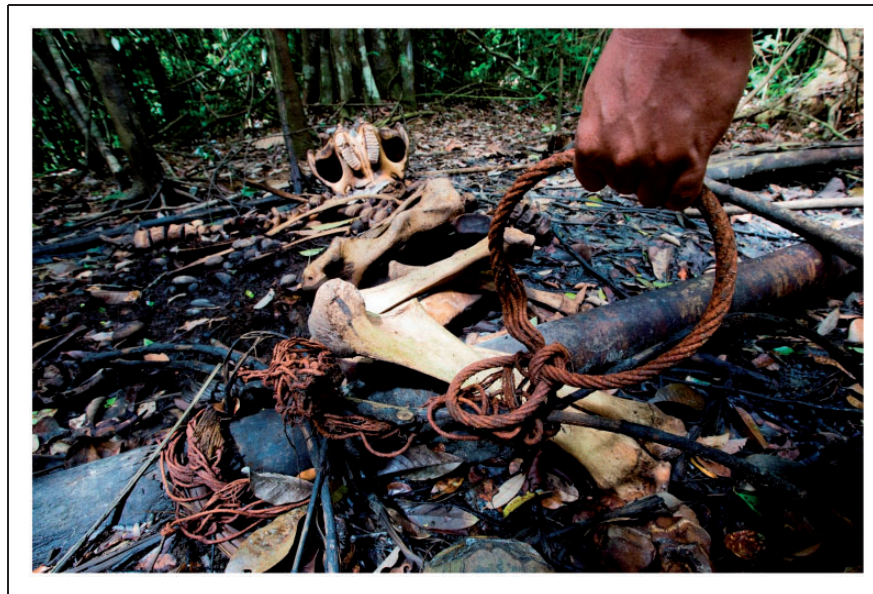
Figure 2. Skeleton of an endangered Sumatran elephant caught in a cable snare trap in the southern Leuser Ecosystem.

to escape, sometimes by self-mutilation (i.e., chewing through an ensnared limb to free itself) (Noss, 1998). These crippled individuals face considerable hardships if they survive (Figure 3).