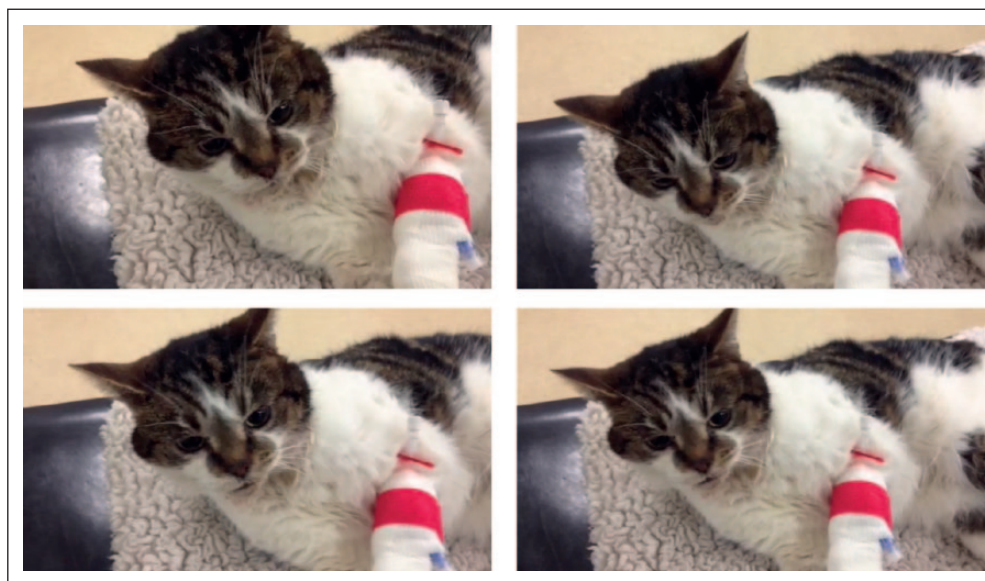
Figure 2 Focal seizure demonstrating the cat's facial twitching (see also Video 1 in the Supplementary material)

marked head pressing, persisted but did not deteriorate further over the following 24 h. The respiratory rate increased overnight and respiratory effort had markedly increased. Therefore, an exploratory laparotomy was performed to address the chronic diaphragmatic rupture on the second day following admission. It was suspected that the clinical signs of the cat were due to hepatic encephalopathy (HE) from multiple acquired portosystemic shunts (MAPSS) secondary to portal hypertension.