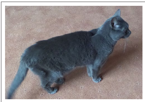
Figure 3 Photograph of the cat >1 year after diagnosis

of pancreatitis, presenting clinically with signs related to EPI. Macroscopically, the pancreas retains its usual shape, with superficial lobular markings and sometimes moderate enlargement; grossly, the pancreas is pale yellow and rubbery. 6 These cases have massive replacement of acinar cells by mature adipose tissues, spared islet cells and minimal-to-mild periductal fibrosis. Some cases appear to be caused by bile duct obstruction by calculi but others have been associated with advanced hepatic disease, including bridging fibrosis, 5,6,8 as seen in the current case, and there is some speculation as to whether the liver disease in some way causes the changes in the pancreas.