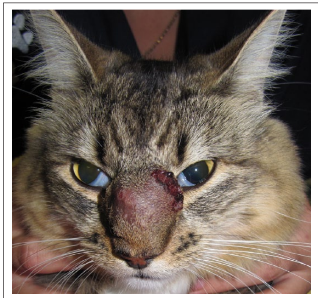
Figure 1 Large subcutaneous swelling over the nasal bridge at initial presentation

empirically with amoxicillin–clavulanate (12.5 mg/kg PO q8h for 10 days) (Amoxyclav; Apex Laboratories) and enrofloxacin (6.25 mg/kg PO q24h for 10 days) (Baytril; Bayer).