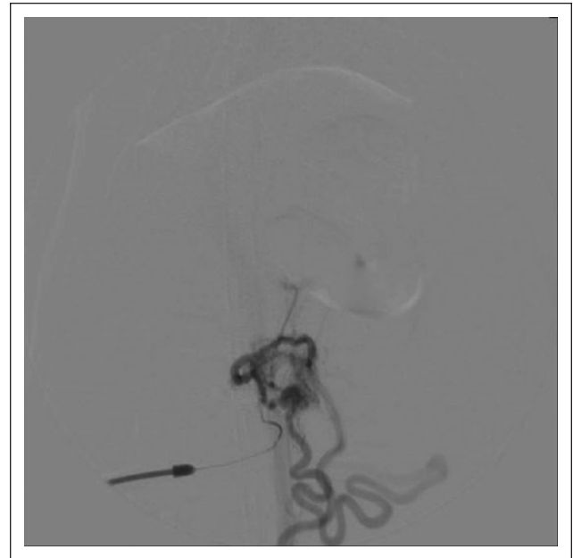
Figure 2 Angiography before coil placement. Contrast medium injected into the portal vein branch immediately diverts into the mesenteric vein and multiple thick shunts are also evident. Portal venous pressure is 26/24 mmHg (mean pressure 24 mmHg)

IHAPF in dogs has been treated surgically by hepatic lobectomy, arterial ligation or arterial glue embolisation.