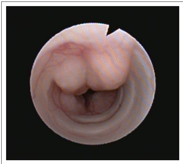
Figure 1 Tracheoscopy: multilobulated intraluminal mass reducing intraluminal diameter to 4 mm in this section