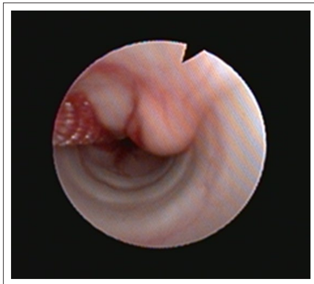
Figure 2 Brush cytology from the multilobulated intraluminal mass

(pH 7.57 [RI 7.24–7.40]; \text{PCO}_2 51 mmHg [RI 34–38]; \text{HCO}_3^- 42.9 mmol/l [RI 22–24]) and moderate-to-severe hypokalaemia (2.5 mmol/l; RI 3.5–5.8). The patient was also negative for feline leukaemia virus (FeLV) p27 antigen and feline immunodeficiency virus antibodies.