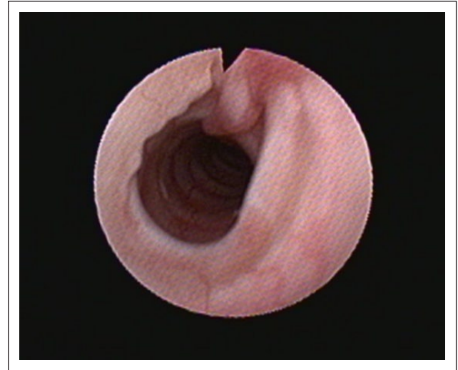
Figure 7 Another picture of the repeated tracheoscopy 3 months after chemotherapy ended

to assess tracheal tumours. In fact, one study reported a sensitivity of 66% for thoracic radiographs and of 91–97% for CT in detecting tracheal and bronchial disease. 15,16 Bronchoscopy is usually used to diagnose and stage tracheal tumours because it allows direct visualisation and tissue samples to be obtained from the tumours. 14 CT should be considered an appropriate and often necessary diagnostic modality in cats with inspiratory dyspnoea, if radiographs fail to demonstrate any obvious or conclusive abnormality. 16 However, as in this case report, where a CT scan of the neck failed to show the presence of the mass, it is advised that an upper airway tract endoscopy should be performed in cases with normal CT images.