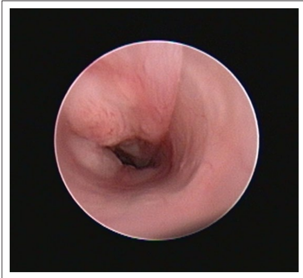
Figure 3 Repeated tracheoscopy prior to surgery: mass slightly reduced in size