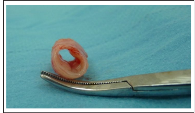
Figure 4 Seven rings of the trachea removed, showing the intraluminal mass

CT scan of the neck and thorax followed by surgical excision of the tracheal mass, owing to the inconclusive results from the brush cytology and the potential of being a neoplastic mass. The cat was premedicated with acepromazine (ACP 2 mg/ml injectable [Novartis]; 0.01 mg/kg IV) and methadone (Comfortan 10 mg/ml solution for injection for dogs and cats [Dechra]; 0.2 mg/kg IV), preoxygenated for 10 mins, induced with propofol (Vetofol 1.0 % w/v emulsion for injection; Norbrook) titrated to effect and maintained using isoflurane (Isocare 100% w/v Inhalation vapour, liquid; Animal Care). A CT scan (Somatom Spirit, 2-slice; Siemens) of the neck showed a poorly defined flattening/narrowing of the trachea ventral to C4–C5 vertebrae, but neither obvious mass nor abnormal contrast uptake were evident. Therefore, a 1.9 mm × 30° oblique telescope was used to repeat a tracheoscopy (Figure 3). The mass was slightly reduced in size but was still causing partial intraluminal occlusion.