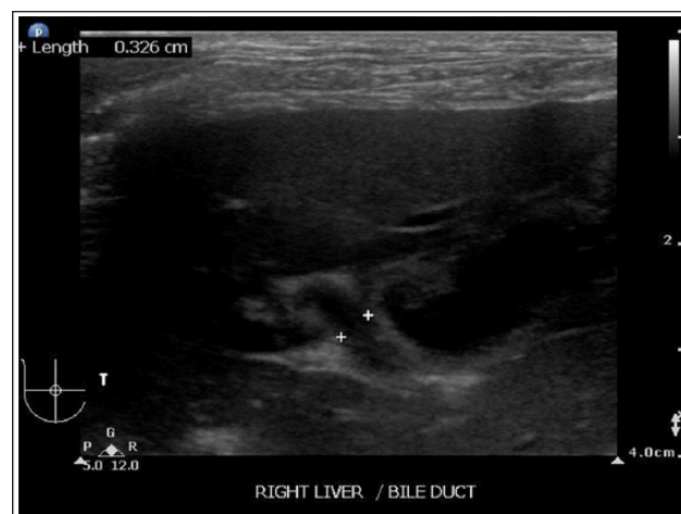
Figure 2 Ultrasound examination day 3. Tortuous bile duct