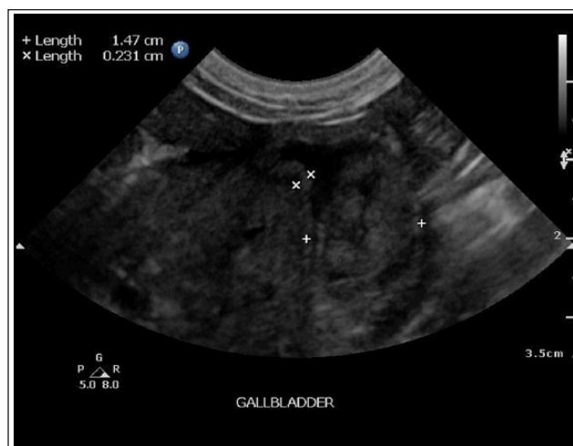
Figure 1 Ultrasound examination day 3. Gall bladder wall thickening is present (x) and there is echogenic material in the gall bladder lumen (+)