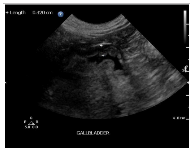
Figure 3 Ultrasound examination day 12. Gall bladder wall thickening persisted with mucosal irregularity noted. There was less echogenic material in the gall bladder lumen