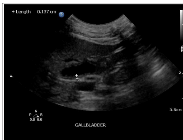
Figure 5 Ultrasound examination day 101. There was marked improvement in the gall bladder wall thickness and appearance with anechoic gall bladder contents