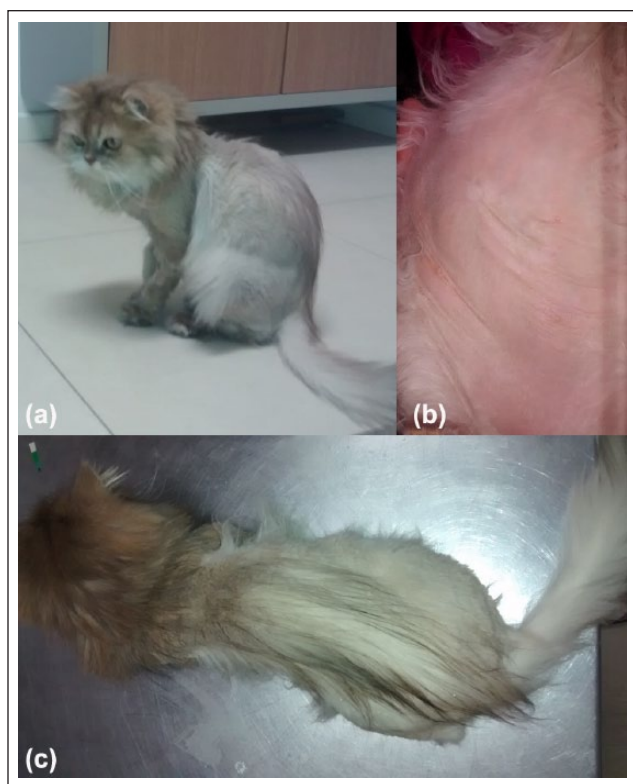
Figure 1 (a) Emaciation, muscle loss, unkempt haircoat and alopecia. (b) Fragile thin inelastic skin. (c) Bilateral symmetrical alopecia, unkempt haircoat, and potbellied abdomen

hyperadrenocorticism (HAC). Blood work and urine analysis results are shown in Table 1. A serum fructosamine concentration suggested good control ( 369 \mu\text{mol/l} ; reference interval [RI] for good diabetic control established by the employed laboratory 350\text{--}400 \mu\text{mol/l} ). However, given the persistence of clinical signs and the results of serial blood glucose evaluation (Table 1, Figure 2), the glargine dose was increased to 4 \text{ U q12h SC} . One week later, a low-dose dexamethasone suppression test (LDDST; using 0.1 \text{ mg/kg} dexamethasone IV) was conducted, the results of which proved compatible with pituitary-dependent HAC (PDH): basal cortisol 143.7 \text{ nmol/l} (RI 10\text{--}138 \text{ nmol/l} ), 4 \text{ h} post-dexamethasone 64.6 \text{ nmol/l} and 8 \text{ h} post-dexamethasone 49.4 \text{ nmol/l} (normal response <38 \text{ nmol/l} ). Additionally, bilateral adrenomegaly was present on abdominal ultrasonography (US), further supporting this diagnosis (Figure 3). The liver appeared a little heterogeneous on US, whereas the gall bladder showed thickened walls ( 0.25 \text{ cm} ), suggesting cholecystitis.