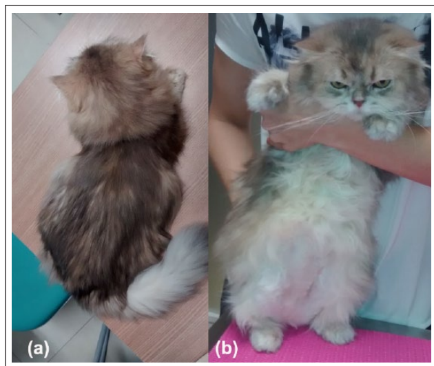
Figure 4 (a) Weight and muscle mass gain, complete haircoat re-growth and re-pigmentation. (b) Loss of potbellied appearance and ventral abdominal haircoat re-growth

months of trilostane treatment emphasizes the need for careful monitoring of insulin-treated diabetic cats with underlying HAC treated with trilostane, as iatrogenic hypoglycemia can pose a danger if the onset of remission is missed. 13 Indeed, in the current case, it would have been indicated to have checked the cat's glucose concentrations more frequently and/or for the owner to have conducted more intense monitoring at home (home blood glucose or urine glucose monitoring); unfortunately, this was not possible for the owner in question. Moreover, this cat might have been able to stop insulin even earlier, once normal fructosamine values and absence of glycosuria were detected at some time points before insulin withdrawal.