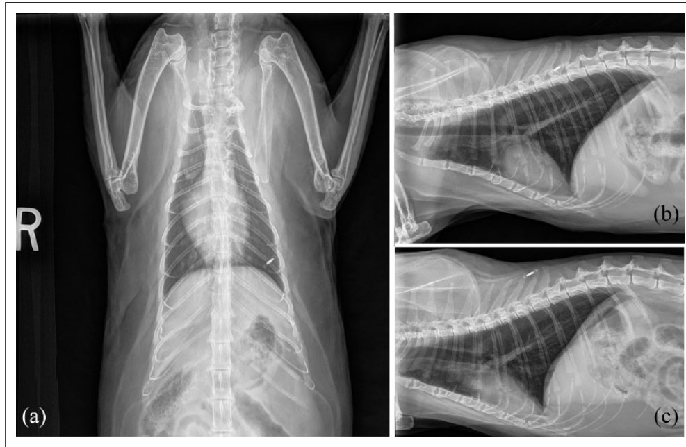
Figure 2 (a) Ventrodorsal, (b) left lateral and (c) right lateral thoracic radiographs. No evidence of primary or metastatic neoplasia was identified