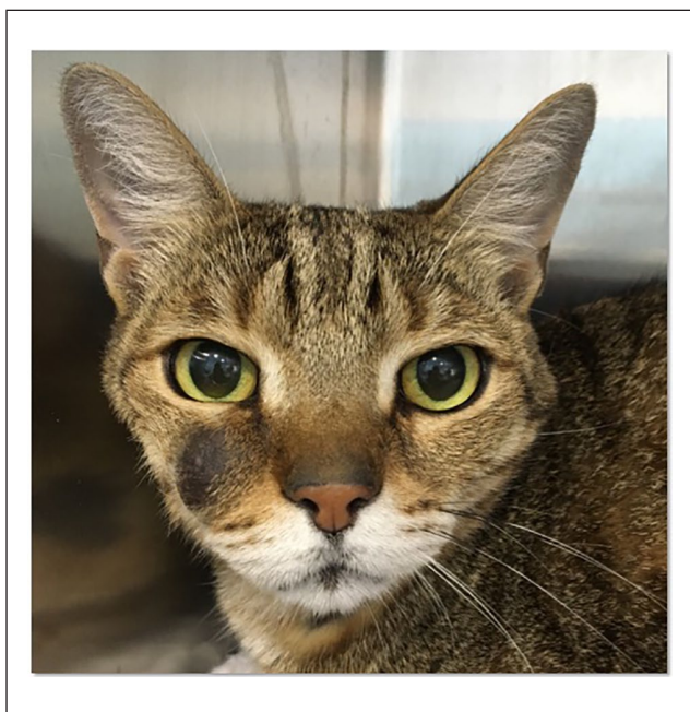
Figure 3 The patient after three treatments with doxorubicin. The mass has reduced by 39% of its original volume and there is a lesser extension towards the right eye and surrounding structures

sporadic, self-limiting gastrointestinal (GI) toxicity (nausea) was reported by the owner and no clinical signs of renal toxicosis or any haematological toxicity were detected. This was classified as grade I according to the Veterinary Co-operative Oncology Group (VCOG) Common Terminology Criteria for Adverse Events. 27