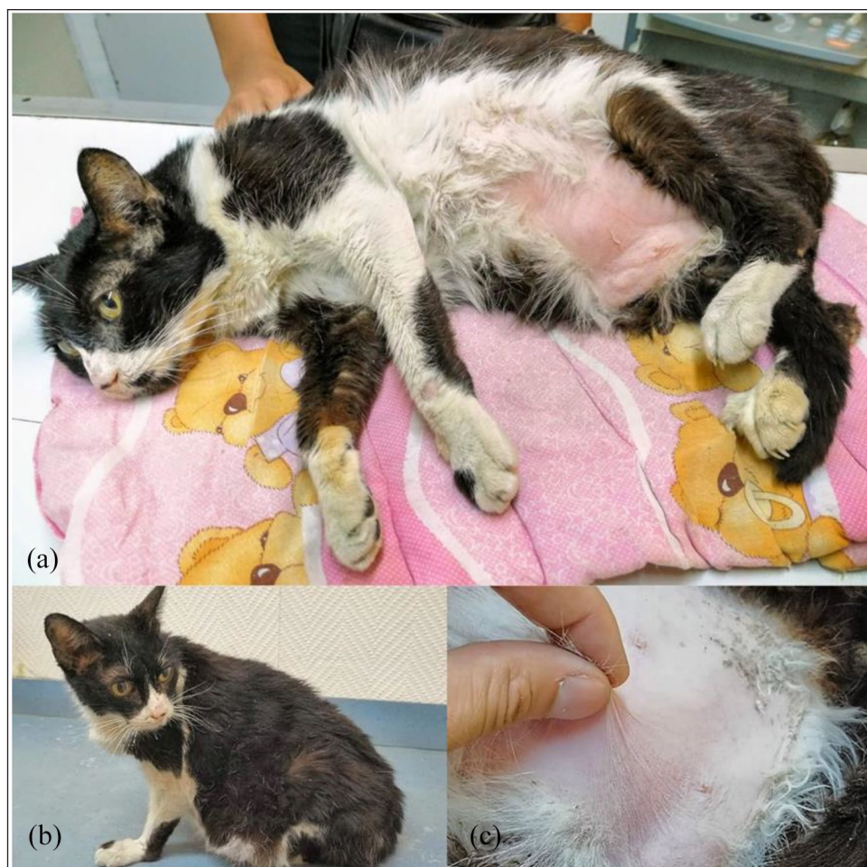
Figure 1 Clinical features of the cat before cabergoline treatment. (a,b) Lethargy, abdominal distension, alopecia and unkempt haircoat; (c) fragile, thin, dry and inelastic skin

adrenal longitudinal section: 1.81 \times 0.55 cm; left adrenal longitudinal section: 1.40 \times 0.65 cm) and hepatic steatosis were evidenced (Figure 2). Diabetes mellitus (DM) was diagnosed and dietary and medical treatment was started with a commercial diet for diabetic cats (Royal Canin Diabetic for cats) and insulin glargine (1 IU q12h SC [Lantus; Sanofi-Aventis]). The cat had not been previously treated with glucocorticoids or progestagens.