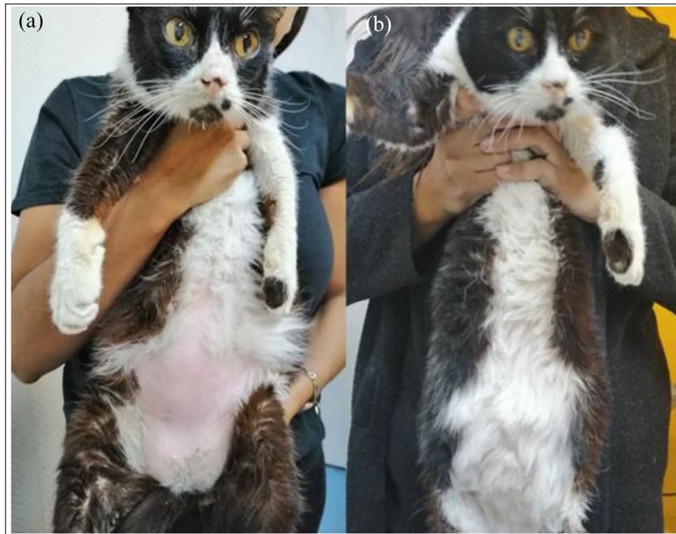
Figure 4 Clinical appearance of the cat, ventral view: (a) at diagnosis of hypoadrenocorticism and (b) at month 3 of cabergoline treatment. After treatment with cabergoline, the abdominal distension was reduced and the alopecic areas were covered with new hair

therapy, for a minimum of 28 days. 9 The cat in this report fulfilled these criteria. Feline diabetic remission was previously described in cats with HAC treated with trans-sphenoidal hypophysectomy, unilateral and bilateral adrenalectomy, pituitary irradiation and also with trilostane. 10–13 In diabetic cats (type 2DM), diabetic remission most often occurs within the first 6 months after the diagnosis of DM. 14 In our cat, diabetic remission was achieved rapidly: around 30 days after insulin therapy and, surprisingly, 3 days after cabergoline treatment with clinical signs of hypoglycemia. In cases of feline secondary DM, such as in this report, diabetic remission could be achieved once the underlying inducing disease is treated effectively. 13,14 However, it is important to highlight that treatment with cabergoline was only associated with diabetic remission and that it is possible that the diabetic remission occurred independent of the treatment with cabergoline.