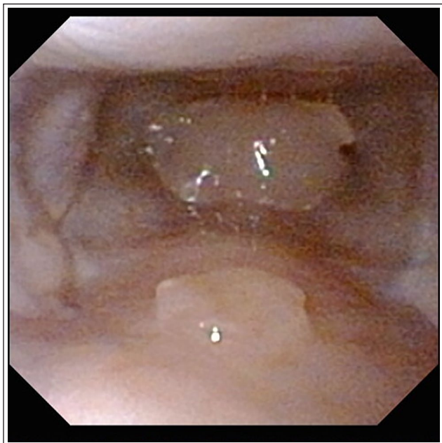
Figure 1 Before debulking, a large cryptococcal granuloma was noted arising from the floor of the nasopharynx, on the anterior-most aspect of the soft palate. Dorsal to the larger lesion was a smaller, similar appearing lesion, likely also a fungal granuloma. In these retroflexed endoscopic views, ventral is at the top of the image and the left side of the patient is the right side of the image