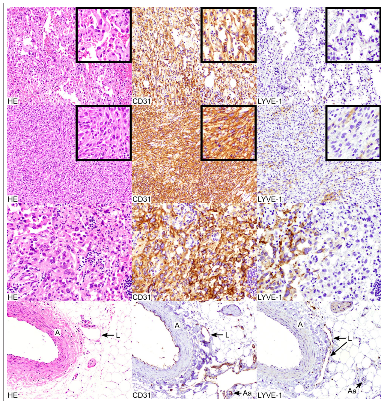
Figure 2 Histopathologic evaluation of the primary tumor, including hematoxylin and eosin (HE), CD31 and lymphatic vessel endothelial receptor-1 (LYVE-1) immunohistochemistry. Row 1 = hemangiosarcoma, well-differentiated region HE/CD31/LYVE-1. Row 2 = hemangiosarcoma, poorly differentiated region HE/CD31/LYVE-1. Row 3 = rarely, there were small regions within the sarcoma showing strong LYVE-1 immunoreactivity that was clearly within sarcoma cells. There was an abrupt transition to LYVE-1-negative cells, although all cells in the area are CD31 + . Row 4 = internal controls for this case HE/CD31/LYVE-1. A = artery, L = lymphatic vessel, Aa = arteriole

(96 k \mu l; RI 128–444). Serum biochemistry revealed azotemia (BUN 93 mg/dl [RI 18–39], creatinine 2.1 mg/dl [RI 0.7–2.0]). Abdominal ultrasound showed a large, multi-cavitated mass (approximately 3.6 cm in diameter) in the caudal abdomen (Figure 3). The mesenteric lymph nodes and ileocolic junction lymph node remained hypoechoic, heterogeneous and rounded, and a large