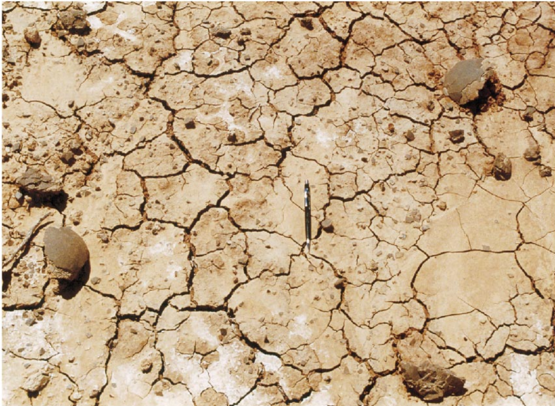
Fig. 4. Fragments of eggs and egg shell weathering out on the flats where the fossiliferous mudstone is exposed. Pencil is about 14 cm long.

ural rate of embryonic mortality. Interestingly, the eggs from this hillside quarry have not yet preserved definitive patches of fossilized skin casts, and the bed containing the eggs is relatively thin, less than 2 m thick.