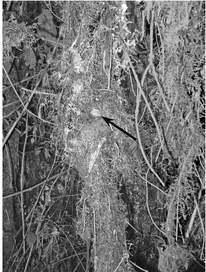
FIGURE 2. A White-browed Spinetail ( Hellmayrea gularis ) nest built into a hanging clump of vines and epiphytes in southeastern Ecuador. The arrow indicates the nest entrance.

The sister relationship between Hellmayrea and Cranioleuca is also not supported by nest architecture. Nests of Cranioleuca spinetails lack bamboo leaves, Tillandsia seed down, and tree-fern scales, and instead incorporate other plant materials, such as woody twigs, rootlets, bark strips, and grass (Remsen 2003; KZ, pers. obs.). Although pensile mossy nests of some