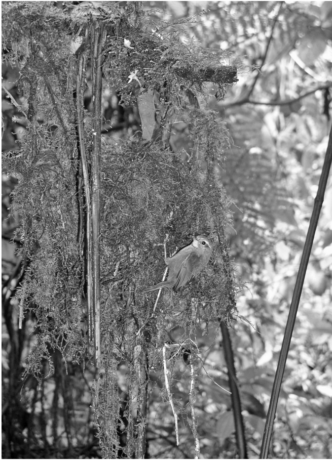
FIGURE 1. An adult White-browed Spinetail ( Hellmayrea gularis ) perched outside the entrance of a nest just after feeding nestlings in southeastern Ecuador.

species to Cranioleuca (Braun and Parker 1985, García-Moreno et al. 1999), or to form part of a clade including other synallaxine genera ( Anumbius , Coryphistera , and Phacellodomus ; Irestedt et al. 2006), its nest architecture does not support any of these relationships. With the exception of Cranioleuca , the aforementioned synallaxines form a clade based on detailed nest synapomorphies (Zyskowski and Prum 1999), none of which are shared with Hellmayrea . In contrast to Hellmayrea , these synallaxines construct domed nests of dry sticks; some have long entrance tubes, thatch, and lining of pubescent leaves ( Synallaxis ); some are entered from above and adorned with conspicuous objects around the entrance ( Anumbius , Coryphistera ); and some are semipensile with a constricted entrance tunnel ( Phacellodomus ; Zyskowski and Prum 1999). Although it is possible that some of these nest characters are the result of these birds inhabiting dry, open environments, the architecture of Hellmayrea nests is dissimilar in too many respects to hypothesize a sister relationship with the aforementioned genera based on nest architecture.