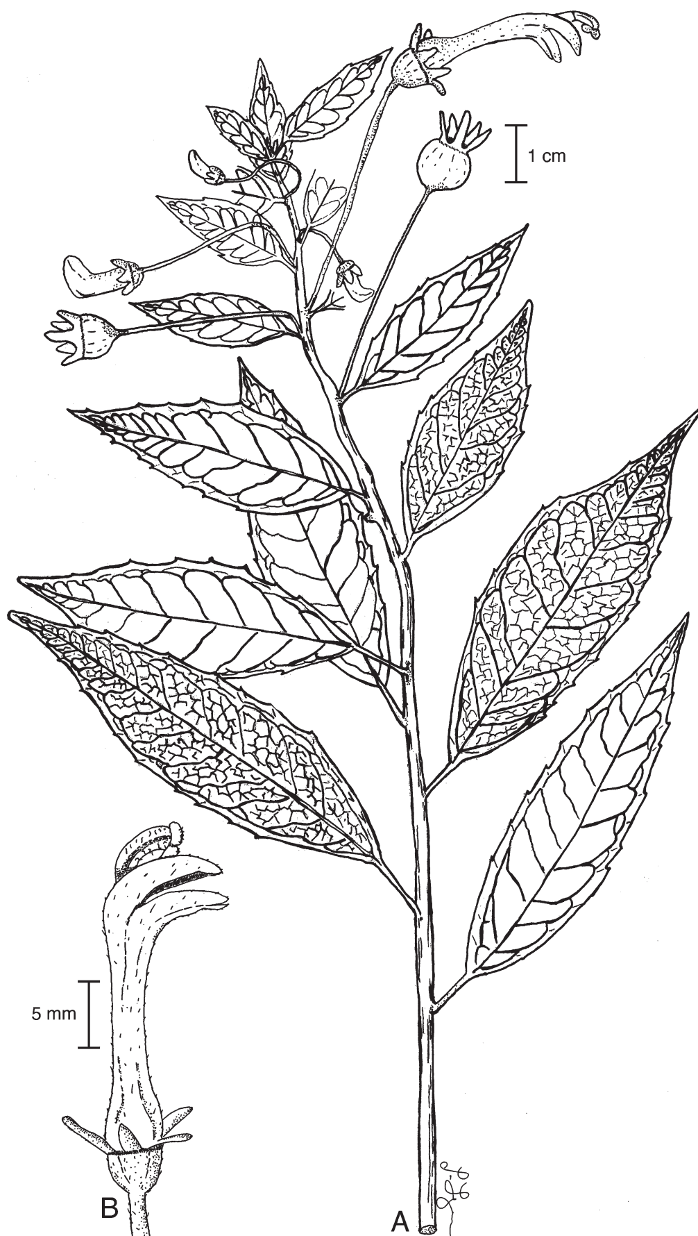
FIG. 1. Burmeistera monroi . A. Habit with flower buds, flower, and fruit. B. Flower in female phase. All drawings by L. Lagomarsino based on A. K. Monro 7142.