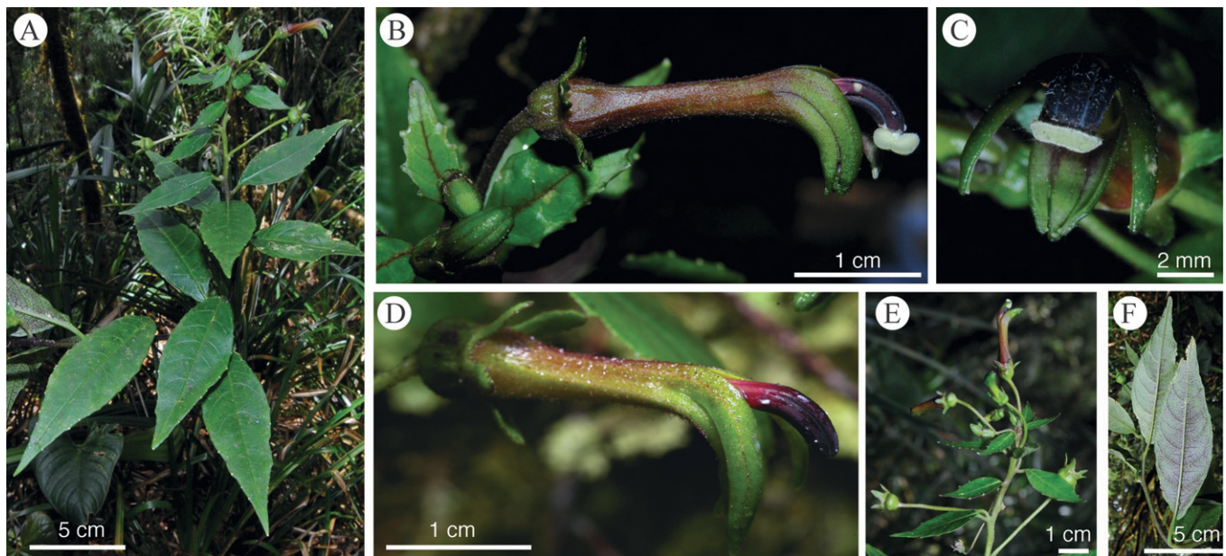
FIG. 2. Burmeistera monroi , photographs from field collections. A. Habit. B. Flower in female phase, lateral view. C. Flower in female phase, frontal view with detail of stigma and anthers. D. Flower in male phase, lateral view. E. Flowering branch with developing fruits. F. Abaxial leaf surface. All photos are of A. K. Monro 7142 except D, which is of A. K. Monro 6986.

from B. monroi by its hemi-epiphytic to epiphytic habit (versus terrestrial), glabrous corolla (versus sparsely to moderately pubescent), and oblong-ovoid berry (versus globose).