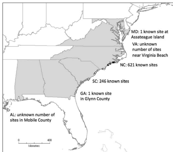
Figure 2. Known distribution of beach vitex ( Vitex rotundifolia L.) in the southeastern United States.

et al. 1999). Globally, according to the Köppen-Geiger climate classification (Peel et al. 2007), beach vitex is known to exist in a host of climatic regions, including three of the six major groups: tropical (specifically, Af, Am, and Aw), temperate (Cfa and Csa), and continental (Dfa and Dwa). It is evergreen in tropical areas, such as Hawaii and deciduous in temperate areas along the coasts of Korea and North America.