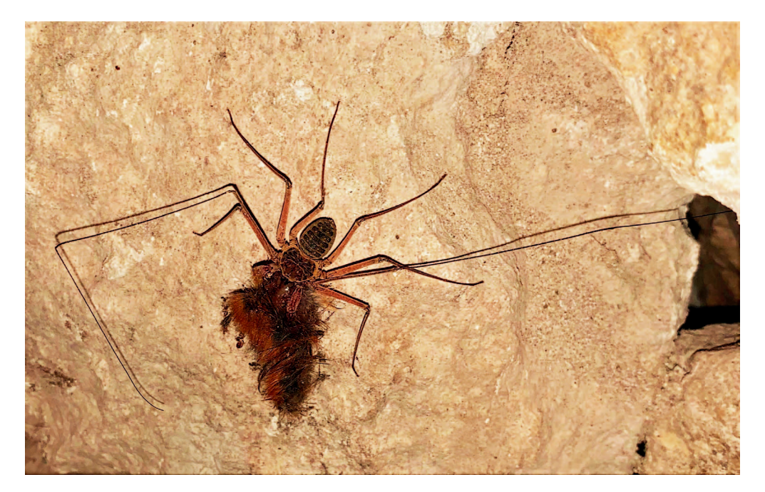
Figure 1.— Paraphrynus raptator feeding on Otonyctomys hatti remains. Low resolution (72 dpi) due to the opportunistic nature of the observation; shot with iPhone XR 4mm, 1/48s, f/1.8, ISO-25, handheld, auto-flash.

Paraphrynus raptator (Pocock, 1902). Paraphrynus raptator is a moderately large species (20–30 mm total length) distributed in the U.S. (Florida), Mexico, Guatemala (Petén), and Belize. This species is a troglophile, is synanthropic and is adapted to a wide variety of habitats, mainly in tropical humid to very humid forests, between 100 and 1500 m.a.s.l. (Armas 2006; Armas et al. 2018).