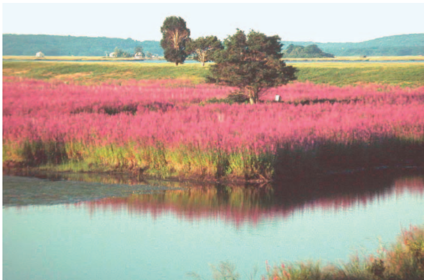
What are the consequences of invasions on ecosystems? Also called the “marsh monster,” purple loosestrife ( Lythrum salicaria ) takes over in wetlands, clogs irrigation canals, and can be nearly impossible to eradicate. This monotypic stand established in a freshwater impoundment at Plum Island, Massachusetts, in the Parker River National Wildlife Refuge.

For every hantavirus out there that kills, says University of New Mexico