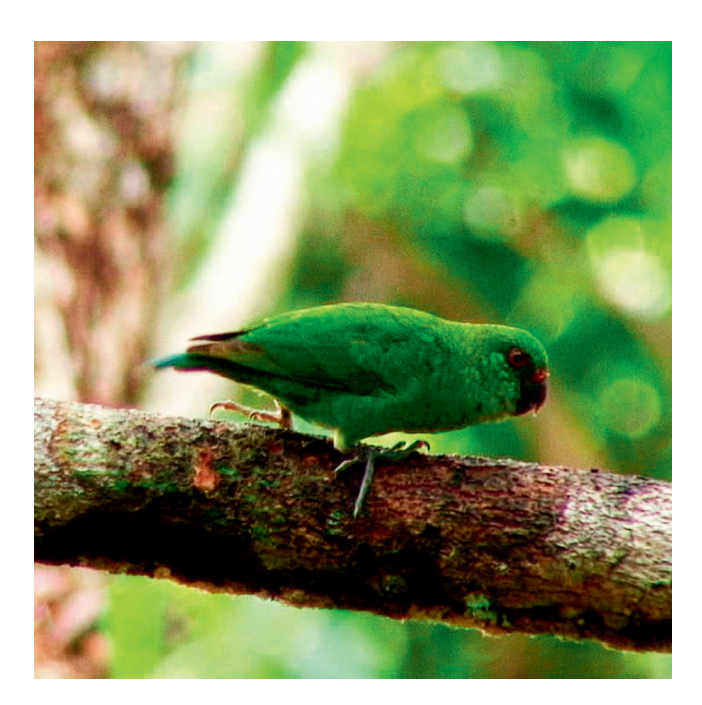
FIGURE 1. Finsch's Pygmy Parrot ( Micropsitta finschii ; also known as the Emerald Pygmy Parrot or Green Pygmy Parrot) is one of several parrots named for Finsch. This pygmy parrot inhabits tropical rainforests of islands in Papua New Guinea, the Solomon Islands, and the Bismarck Archipelago.

Survey in Washington, D.C., in 1904 and spent much of his career there working on economic mammalogy.