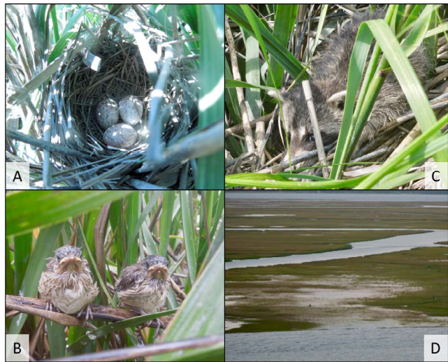
FIGURE 1. Seaside Sparrow nests (A) can fail to produce fledglings (B) as a consequence of 2 primary threats: predation by various avian and mammalian predators, such as northern raccoons (C), and flooding from high spring tides (D). Flooding risk will likely increase with sea-level rise.

(Wilensky 1999). Here I provide a narrative model description (Figure 2); a full description of the model using the ODD protocol for describing individual-based models (Grimm et al. 2006, 2010) is presented in Supplemental Material Appendix A . Model parameters are named using NetLogo hyphenation conventions (Wilensky 1999), and model code is available in Supplemental Material Appendix B . I calibrated this model using data collected from a Seaside Sparrow population in coastal Georgia, USA, from 2013 to 2015 (Hunter et al. 2016b), including estimates of daily nest survival and failure rates (Table 1) and their relationships to nest heights and tidal heights, as well as structural information such as the number of renesting attempts and breeding-season length. Simulated nesting success emerges as a function of environmental conditions (predation and flooding risks) and nest-site selection behaviors along a nest height gradient (Seaside Sparrows' nesting success in Georgia is primarily affected by nest height and tidal height and not by other variables, such as distance to uplands, distance to channel, and territory density; Hunter et al. 2016b).