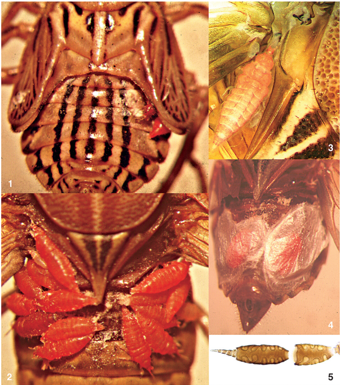
Figs. 1-6. Aulacothrips dictyotus (Heterothripidae) and Aethalion reticulatum (Homoptera). 1. Aethalion nymph with Aulacothrips larvae under wing bud. 2. Aulacothrips larvae on abdomen of Aethalion . 3. Aulacothrips larva under Aethalion hindwing. 4. Aulacothrips pupal cases on Aethalion tergites. 5. Aulacothrips antenna. 6. Aulacothrips tergites VII-VIII.