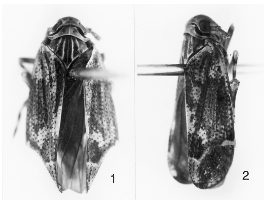
Figs. 1-2. Punana sinica Liang sp. nov. 1. male holotype, dorsal view; 2. same, lateral view.

late, veins distinctly prominent and thickly covered with fuscous granules with long setae, a more or less continuous series of transverse veins before apical area. For forewing and hindwing venation see Asche (1985: fig. 204).